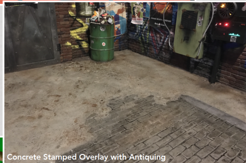
Concrete Stamped Overlay with Antiquing