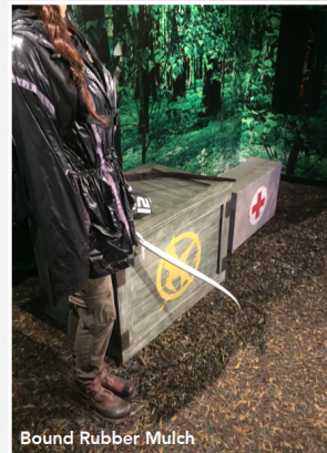
Bound Rubber Mulch