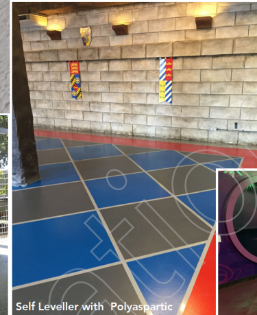
Self Leveller with Polyaspartic