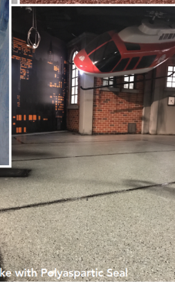
Flake with Polyaspartic Seal