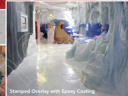
Stamped Overlay with Epoxy Coating