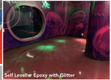
Self Leveller Epoxy with Glitter