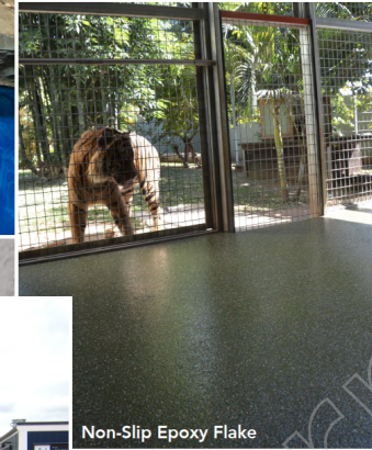
Non-Slip Epoxy Flake