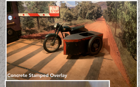
Concrete Stamped Overlay