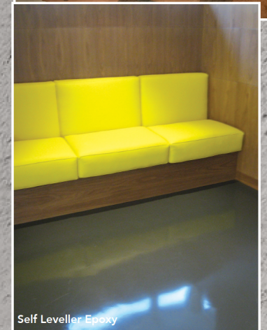
Self Leveller Epoxy