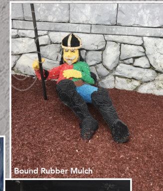
Bound Rubber Mulch