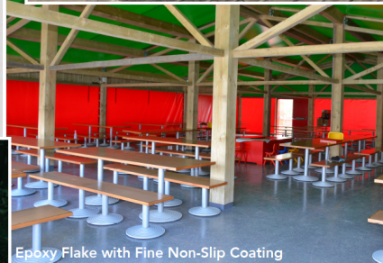
Epoxy Flake with Fine Non-Slip Coating